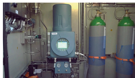
Image 1. The HyDeploy project uses Rosemount 700XA Gas Chromatograph to provide an independent validation of the full hydrogen and natural gas blend rate.

HyDeploy Project Watch Video Visit Website