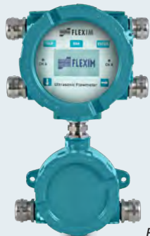
FLUXUS® F/G 831 Aluminium housing