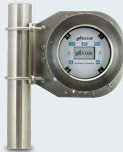
FLUXUS® F/G 831 Stainless steel housing