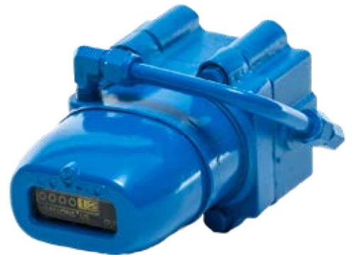
30 WT. OIL FLOW CHARACTERISTICS